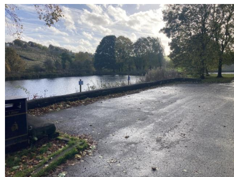
Hardstanding for 4 stalls