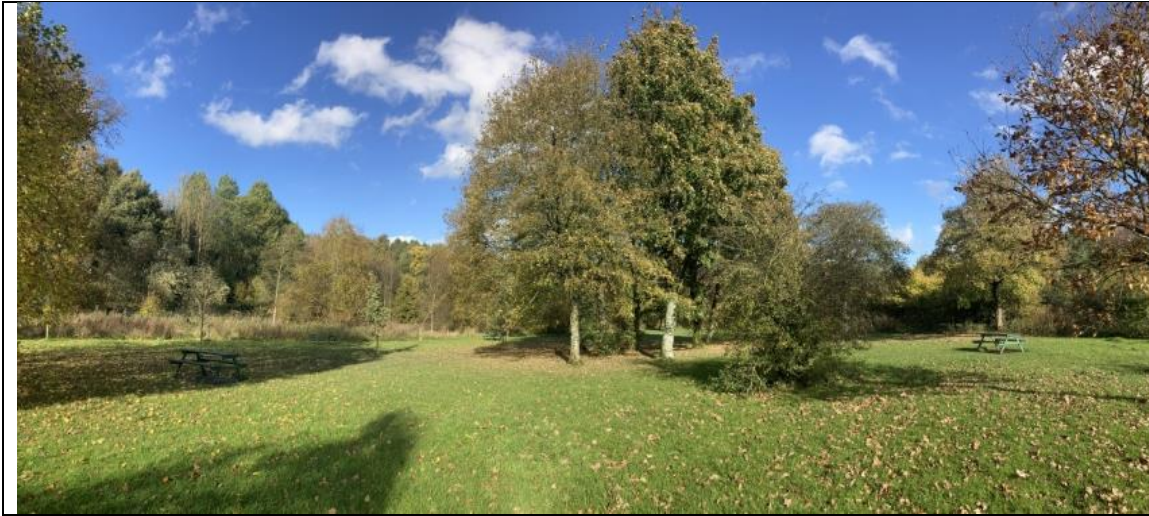
View looking out from the proposed stage area onto the trade ground