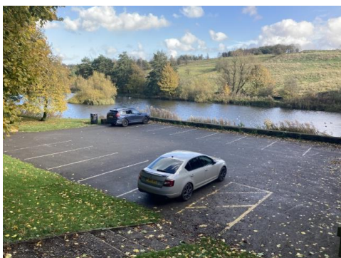
Hardstanding for 9 stalls

It has been identified there is potential for 60 trade stalls in and around the park & lakeside depending on the space we are granted to use.